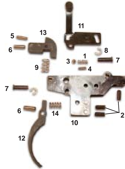
Mauser Trigger Parts Breakdown List